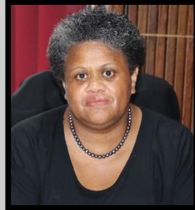
Permanent Secretary for Forestry