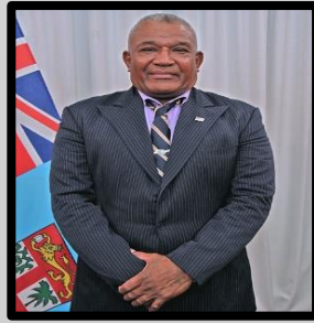
Minister for Forestry Honourable Kalaveti Vodo Ravu